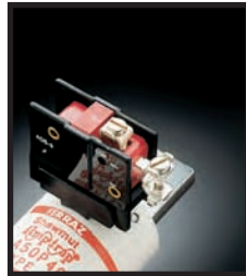
AOS-S Mounted on fuse